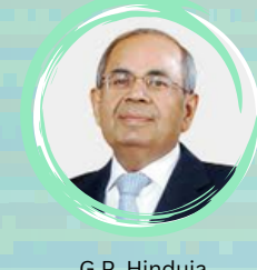
G.P. Hinduja Co-Chairman, Hinduja Group of Companies