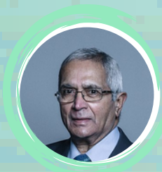
Lord Dholakia Deputy Leader, The House of Lords