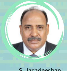
S. Jagadeeshan Former Minister (Economic), High Commission of India, London