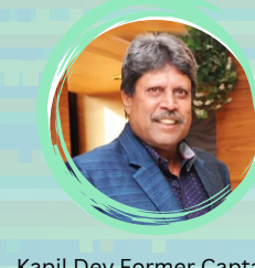
Kapil Dev Former Captain of the Indian Cricket Team & Businessman