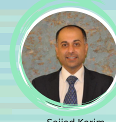
Sajjad Karim Former Member of the European Parliament for NorthWest England