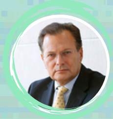
Lord Goldsmith Former Attorney General for England and Wales and for Northern Ireland