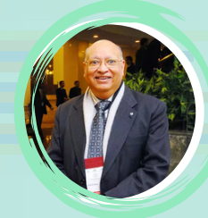
Lord Raj Loomba Member of the House of Lords, UK, Philanthropist, Founder Chairman of Rinku Group