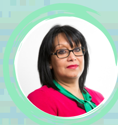
Baroness Verma Member of The House of Lords, UK & Chairman of EU External Affairs Committee