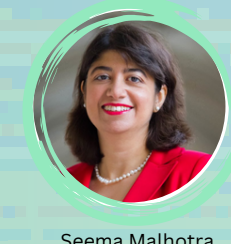
Seema Malhotra Member of Parliament for Feltham and Heston, The House of Commons