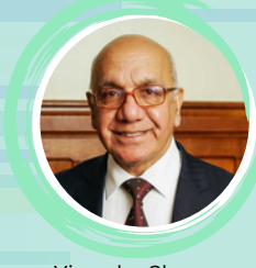
Virendra Sharma Member of Parliament, UK